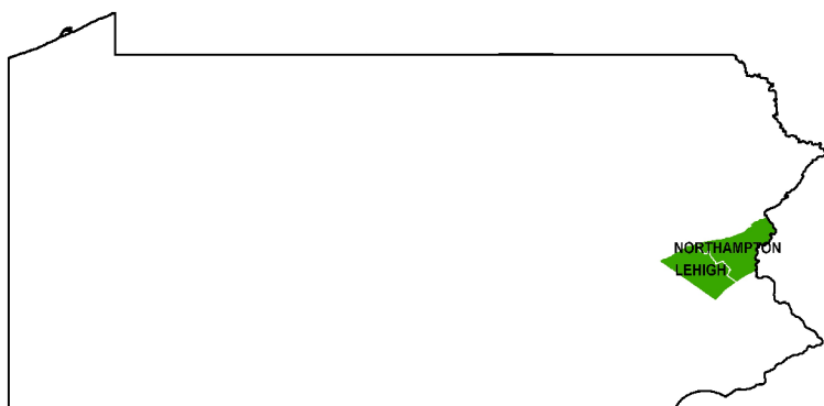
Workforce Development Area (WDA) Unemployment, Jan 2008 to Apr 2018