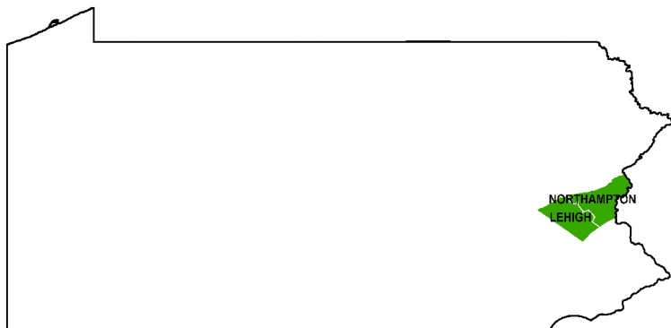
Workforce Development Area (WDA) Unemployment, Jan 2013 to Feb 2023