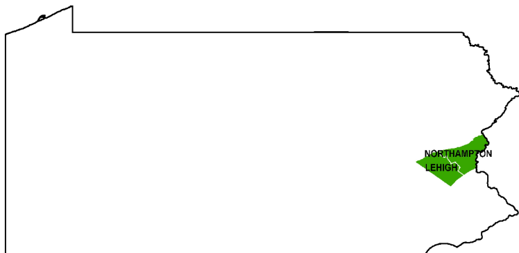
Workforce Development Area (WDA) Unemployment, Jan 2014 to Sep 2024